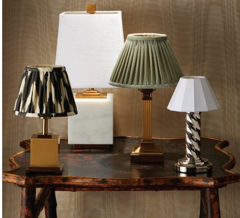
FROM LEFT: Walter cordless table lamp, Pooky. • Annelore table lamp, Currey & Company. • Freya cordless table lamp, Pooky. • Mini Twist lamp, Collier Webb.

A designer's best friend, they light up nooks and corners with a soft, ambient glow. Aim for 8 to 12 inches, small enough to tuck into a bookshelf.