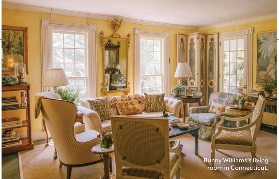
Bunny Williams's living room in Connecticut.