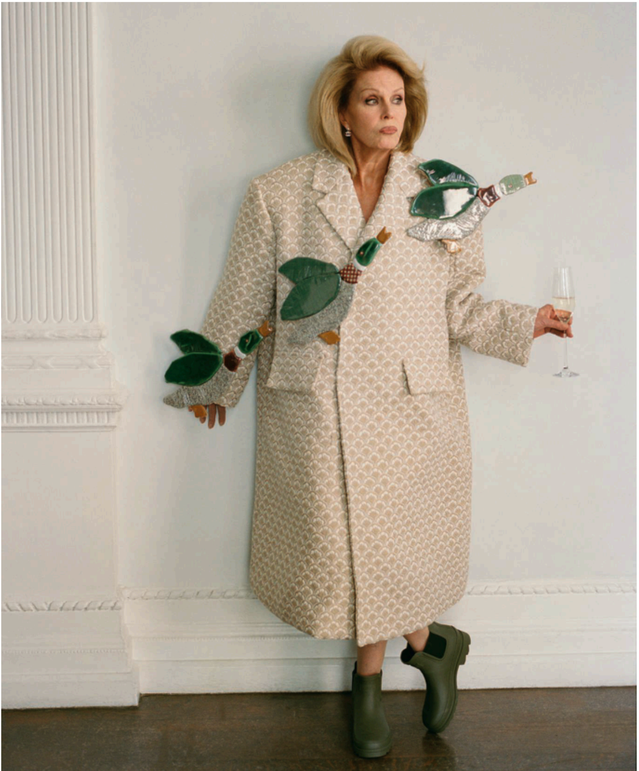
Fashionably late, actor Joanna Lumley more than fits the bill as three flying ducks. Coat: 'Bracken BRA01', £150, Evitavonni. Left duck, head and wings: 'Myriis 9177-04', £157, Black Edition. Body (for all three): 'Saltmarsh 02', by Madeaux, £196, Fox Linton. Neck: 'Myriis 9177-09', £157, Black Edition. Beak and feet (for all three): 'Cotton Velvet COT07', £160, Evitavonni. Middle duck, head: 'Myriis 9177-04', as before. Wings: 'Lahariya LAH-02', by Namay Samay, £160, Tissus d'Hélène. Neck: sumac 'Naka', £156.24, Studio Supple. Right duck, wings and neck: see left duck. Head: 'Lahariya LAH-04', by Namay Samay, £160, Tissus d'Hélène